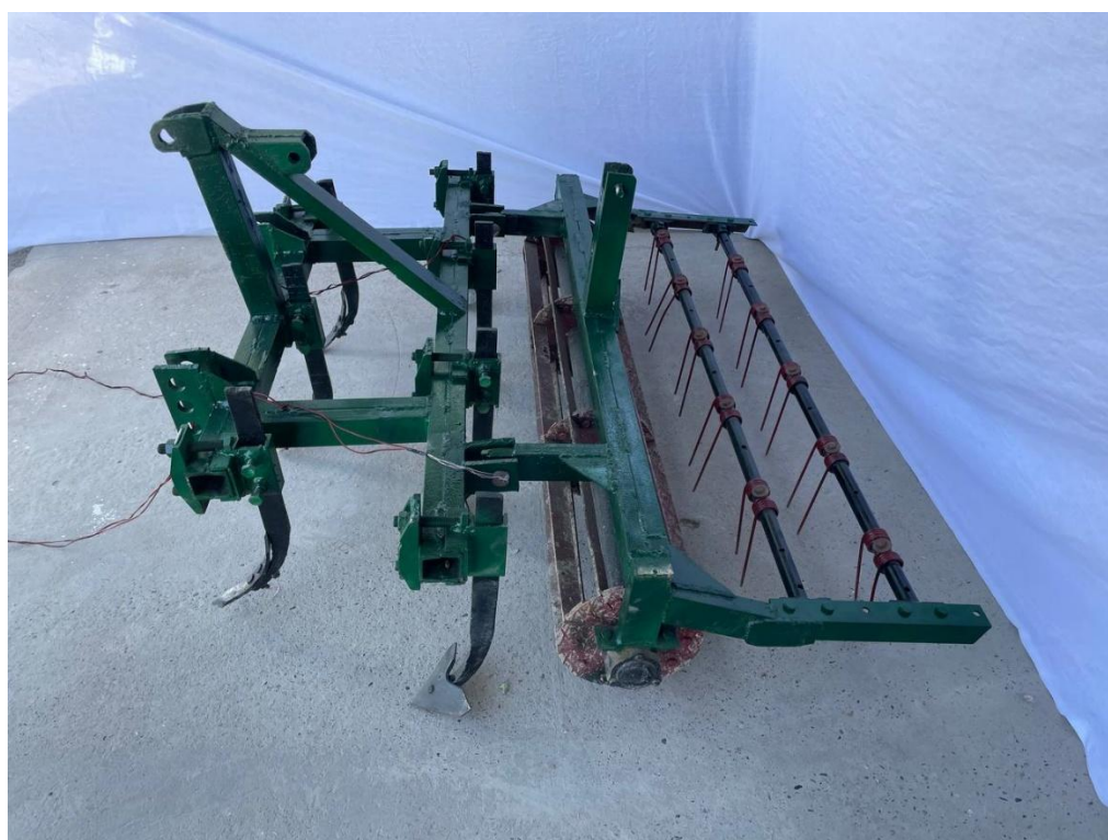
Figure 1. General view of the proposed combined machine.

In conclusion , it can be said that the use of the proposed combined machine ensures an increase in labor productivity, a reduction in labor and material costs by 15-20% due to the preparation of the soil for sowing in one pass through the field.